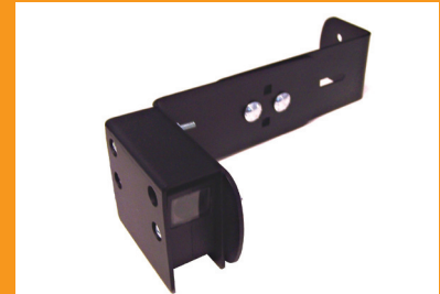
Mounting bracket kit (x2)